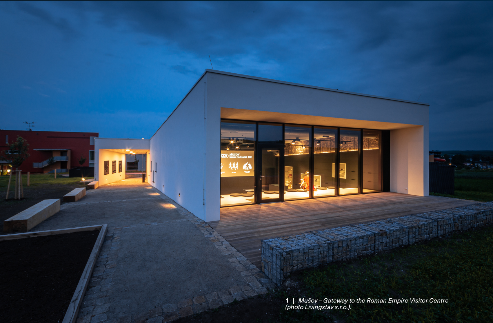
1 | Mušov – Gateway to the Roman Empire Visitor Centre.